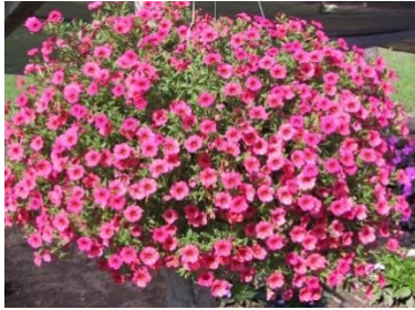
Calibrachoa-Million Bells Part Shade/Full Sun $30