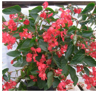
Dragon Wing Begonia Shade $30