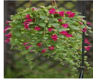
Lofus' Full Sun $30