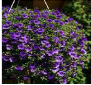
Trailing Petunia Full Sun $25